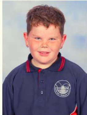
Public Relations Minister